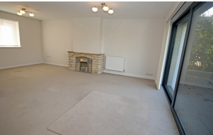
A well presented, detached bungalow conveniently located within a short walk of the town centre, schools and main bus route.

Hall, open plan living/kitchen/dining room, 3 bedrooms, modern shower room/WC and cloakroom/WC. Garage and parking. Attractive, enclosed garden with summerhouse. Upvc double glazing. Gas fired central heating. EPC band D. No forward chain.